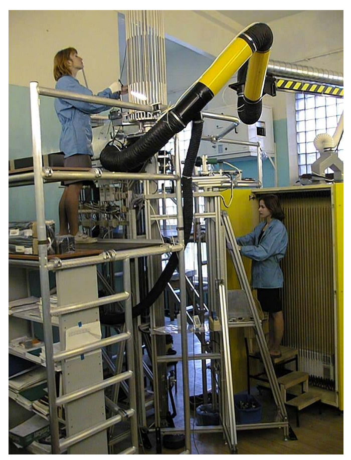
Fig. 2. View of Straw Reinforcement Machine at PNPI

is coated with a 4–5 \mu m polyurethane layer acting a heat-seal compound. The straw as is manufactured by winding two 10 mm wide tapes on a precisely tooled rod at temperature of ~260°C. The Kapton film alone has poor mechanical properties. The straw would be affected by thermal and humidity variations. In order to improve the straw mechanical properties, they were reinforced along its length with four sets of thin carbon fibre bundles. The C-fibres were bounded to the tube outer surface at 90° with respect to each other, using a special machine (Straw Reinforcement Machine – SRM), which was designed at CERN. The SRM is a semi-automatic device. After a group of naked straws is loaded into the drum, the carbon fibre pass over a series of rollers, and an impregnation pot wets the fibres with epoxy resin ensuring uniform resin distribution and tension. A specialized workshop has been organized at PNPI for the straw reinforcement (Fig. 2). The PNPI SRM workshop has produced ~110,000 long reinforced straws (1650 mm length). Stringent quality control steps were implemented in the straw reinforcement process. They include fibre delamination tests and straw geometry measurements (straightness, inner and outer diameters and local deformations or defects). The production yield was 98% at the production rate of ~6000 straws per month.