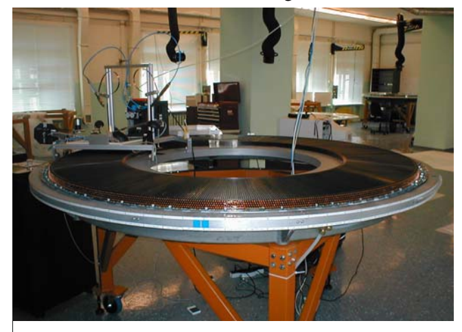
Fig. 5. Assembly of TRT wheels at PNPI. 4-plane wheel prepared for the wire stringing

petals. The first layer of the flex circuit is used to provide a reliable high-voltage connection to the straw cathode. The high-voltage plastic plugs are inserted through the petals into the straw making contact with the inner straw walls. The signal connection is done in an analogous way using the second flexible layer and the custom-designed copper crimp-tubes inserted through the petals in the second layer. These copper crimp-tubes are used to fix the anode wires on the outer radius (Fig. 5). The other custom-designed copper crimp-tubes with isolation are used to fix the anode wires on the inner radius. The WEB transmits the signals to the front-end electronics boards through three connectors each corresponding to 32 channels.