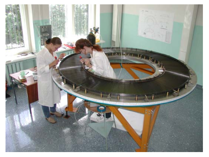
Fig. 4. Assembly of TRT wheels at PNPI. Straw insertion and gluing into the carbon support rings

Flex-rigid printed circuit boards (Wheel Electronic Board – WEB) are used to distribute high-voltage to the straw cathode and to readout signals from the anode wires. There are 32 separate WEBs per one wheel. The flex-rigid printed circuit board contains two flexible layers of the circuit made from polyamide film. Each flex circuit contains holes with inward-printing