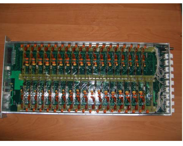
Fig. 2. 36-channel Remote Distributor

voltage setting and actual voltage and current values for each channel.